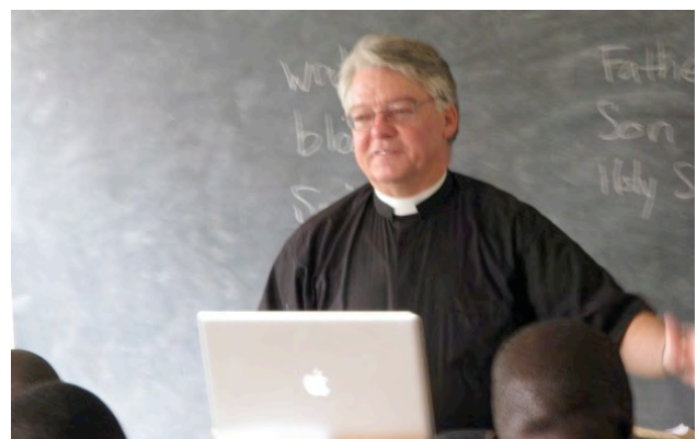
Back to the main task. Discussing sacramental and Trinitarian interpretations of I John 5:6-9. It is hard to imagine a greater joy than to open the Scriptures as I did this day with the baccalaureate class of 30 Kenyan students.